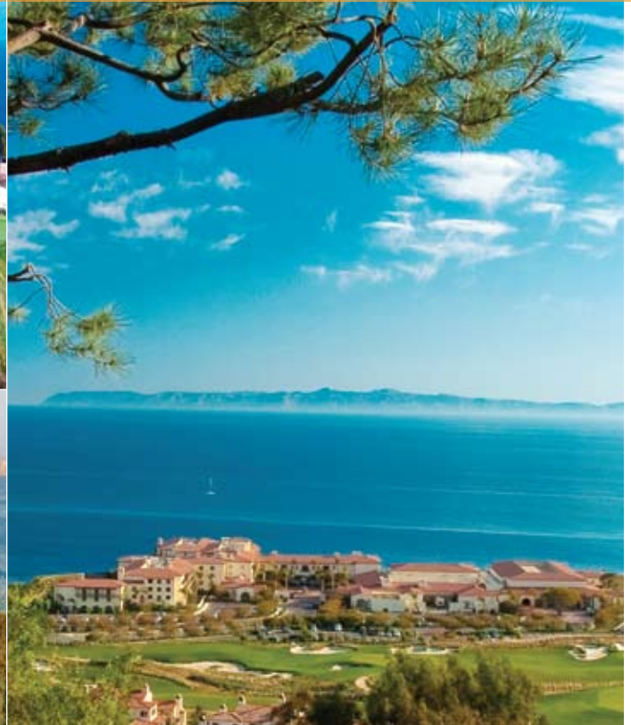
Clockwise from top left: Kids 12 and under play Terranea's nine-hole golf course for just $15 on weekends when they play with a parent; 85 percent of rooms share this cliff-top ocean view of Catalina on clear days; hiking trails on-site are a good excuse for family time.