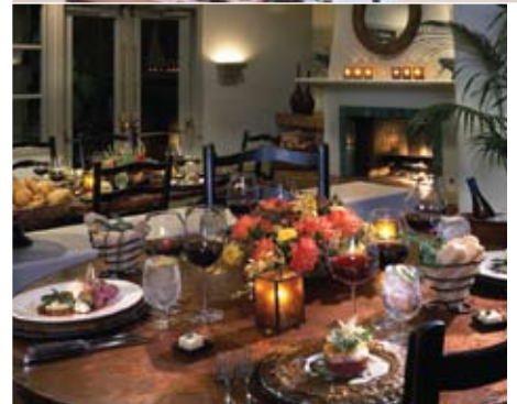
ABOVE: Ocean-view rooms are worth the splurge at The Cliffs Resort in Pismo Beach; a heated pool makes moms-to-be feel weightless; dinner at Marisol offers stunning views and innovative, delectable cuisine.